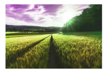
Environment and Agrifood