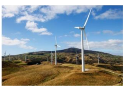
Energy and Sustainability